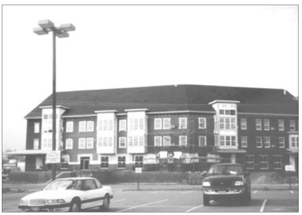
Chaska's brickyard development.

The building will have a mix of office, retail, and apartment space. Renovations have begun, and the HRA expects the project to be completed in early 2001. When completed, the HRA's offices will be located on the first floor, along with 2,200 square feet of retail space. Thirty-two apartments will occupy the upper floors and rent for $510 to $700 per month.