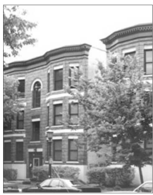
CommonBond's Cathedral Hill apartments.

CommonBond Communities, a nonprofit provider of affordable housing and support services, recently purchased and rehabilitated a complex of seven deteriorating apartment buildings near the St. Paul Cathedral. Before CommonBond's intervention, the buildings were 50 percent vacant and in danger of converting from affordable units under the federal government's Section 8 program to market-rate housing. Many of the nearby buildings had recently converted to upscale apartments and condominiums, and CommonBond pursued the project in part to demonstrate how to successfully maintain and operate low-income housing in such a neighborhood.