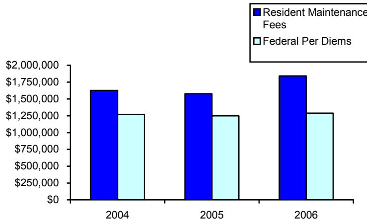
Figure 2-1 Resident Maintenance Fees and Federal Per Diems Fiscal Years 2004 to 2006